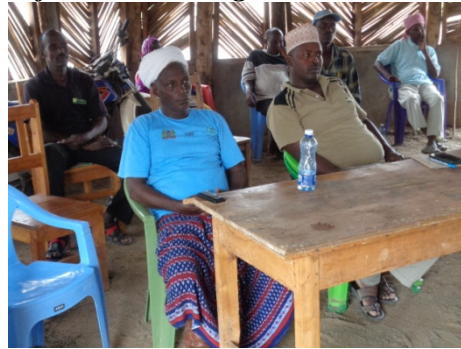
The participants attentively listening the facilitators