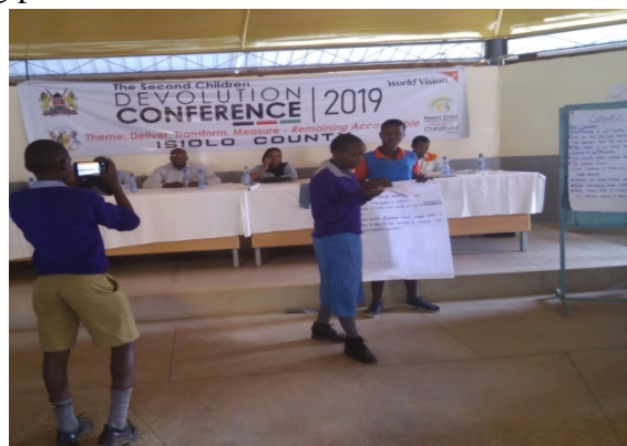
Children Leaders doing presentations at county level on the 4 big agendas

In collaboration with Council of governors, the programme facilitated participation of Children in this year’s Children Devolution conference which was held in Nairobi primary school on 17 th to 21 st February 2019. Children were drawn from all the 47 counties in Kenya. Upon request by council of governors the programme supported children from Isiolo and Marsabit Counties to participate in the occasion after conducting engagement forums at county level where children leaders from various sub counties convened for a half day discussions and developed county children charters based on the Big 4 Agendas and thereafter appoint 5 children who represented their counties during the children conference. At the County level various partners supported the occasion including department of children services and World Vision. This was aimed at raising children affairs in the National Devolution Conference held on 6 th March 2019 at Kirinyaga County, Kenya This initiative also promotes children participation in taking part in major decision making processes.