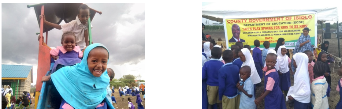
Fig 1: Children playing during fun day held in Kiwanjani Primary School Isiolo County.

With overall objective of enhancing awareness and fundamental importance of ECCD, the organization during the financial year ended supported 2 ECD Centers with assorted playing materials benefitting 310 children (158 M, 152 F). This will promote quality learning for children at the center and as well reduce congestions in class.