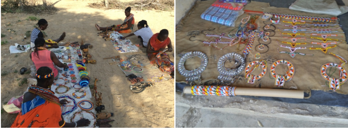
Naashapa Women group displaying their beadwork for sale in Lorubae Village, Samburu County.

In the spirit of ensuring a sustained effort to improve nutrition for vulnerable children among the community, Nawiri Child Development Programme, in Maikona have this financial year supported 9 vulnerable children (4girls and 5 boys) on quarterly basis with food items. The children were supplied with dry food items like rice, sugar, maize, beans, oil, tea leaves and milk throughout the 12 months of the year.