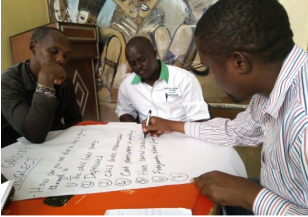
Fig 1: Programme staff and Parents during group discussion.