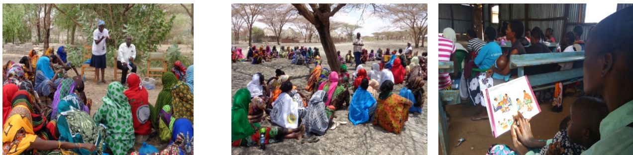
Caregivers during training sessions.

In collaboration with department of health, Nawiri Child Development Programme trained 600 (33 M, 567 F) caregivers in Archers Post, Samburu County, Marsabit and Maikona, Marsabit County on IMCI (intergrated management of childhood illnesses), malezi bora intiatives, child immunization, importance of breast feeding and importance of NHIF (National Hospital Insurance Fund) cover for the family. The training took 3 days each across all the zones in the programme area of coverage. In most instances, primary caregivers form the foundation of child health and development, having consistent caregivers who respond to their needs and provide love, interaction and play will stimulate their growth at tender age. For sharing such vital information, the expected results are sensitized caregivers who are responsive, knowledgeable and support child development needs.