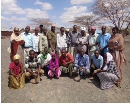
The participants posing for group photo after the training