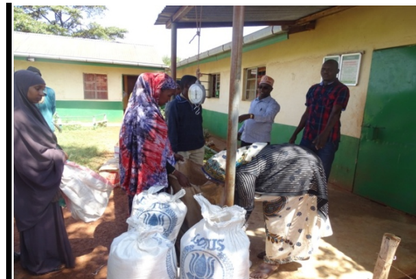
Pregnant and lactating mothers receiving maize,beans,oil and soap in December 2018 Korea DRR project.